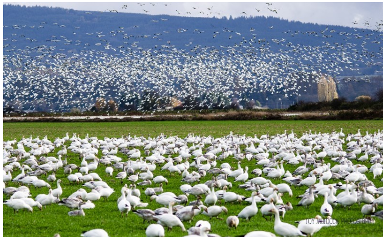
Photo of snow geese at the Fir Island Farms Unit of Skagit Wildlife Area by Roy Murdock.

The Washington Department of Fish and Wildlife works to preserve, protect and perpetuate fish, wildlife and ecosystems while providing sustainable fish and wildlife recreational and commercial opportunities.